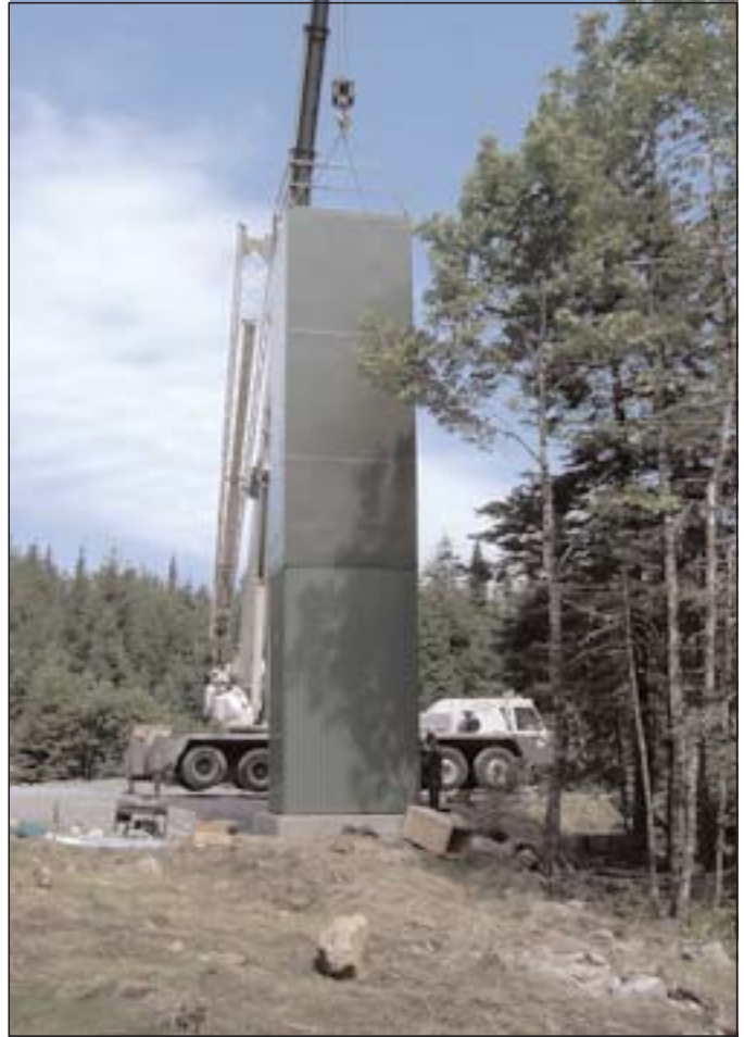
The lime doser almost in place

Next we had to get the power line in. This requires clearing an area along the road to place the poles. There was some concern about where the line should go, so I met on site a couple of times with representatives from both Neenah Paper and Nova Scotia Power to clarify the issue. Chris van Slyke led the work of clearing the area and the poles were installed